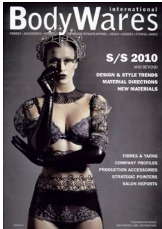
BODYWARES n° 2 Gennaio 2009