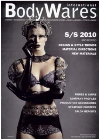
BODYWARES n° 2 Gennaio 2009